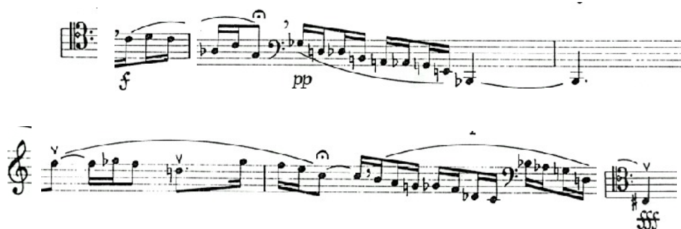
Figure 2: Two instances of the segmental pattern [[+,-,+,-],[-]] in Keren . Top: segments 3 and 4; Bottom: segments 17 and 18. Score fragment reproduction from Keren , Editions Salabert, Paris, 1989.

Figure 2 demonstrates this pattern and its instances. The two instances have an interesting similarity between them, the first pattern in each being the characteristic melodic pattern which makes use of the intervals \pm 1 , \pm 4 , \pm 5 , and the second being this downward characteristic movement, also seen in the melodic viewpoint results above.